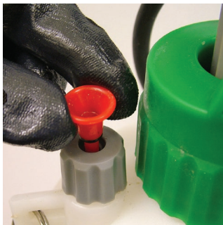
Pressure Release Valve